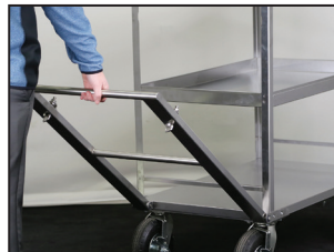
Handle in open position for pulling motion

Rugged Design For Moving The Heaviest Cargo Loads Across Rough Terrains And Long Distances.