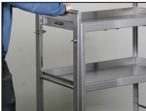
Handle in closed position for pushing motion